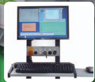
True PC-Controlled and Nesting Software included